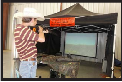
KDWPT Laser Shooting Simulation

In addition, Chevrolet Ride & Drive was at the show each day with brand new Chevrolet vehicles available to test drive.