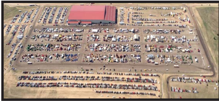
Aerial Photo of the 59th Annual 3i SHOW