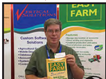
Vertical Solutions Easy Farm Software Package Doug Burr